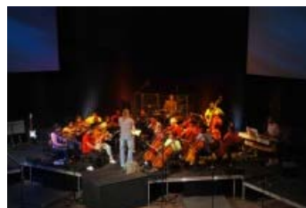
Strings of Color Orchestra rehearses for their May 16 concert at Chase Oaks Church Youth Center in Plano.